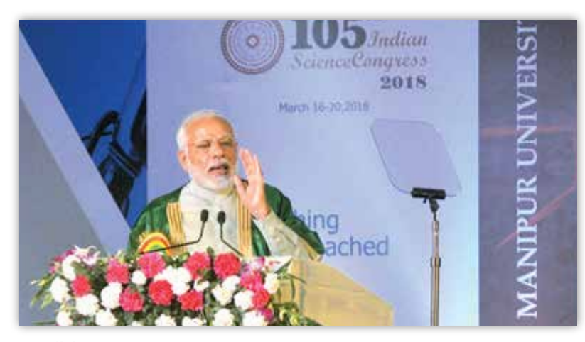
Hon'ble Prime Minister Shri Narendra Modi addressing Indian Science Congress