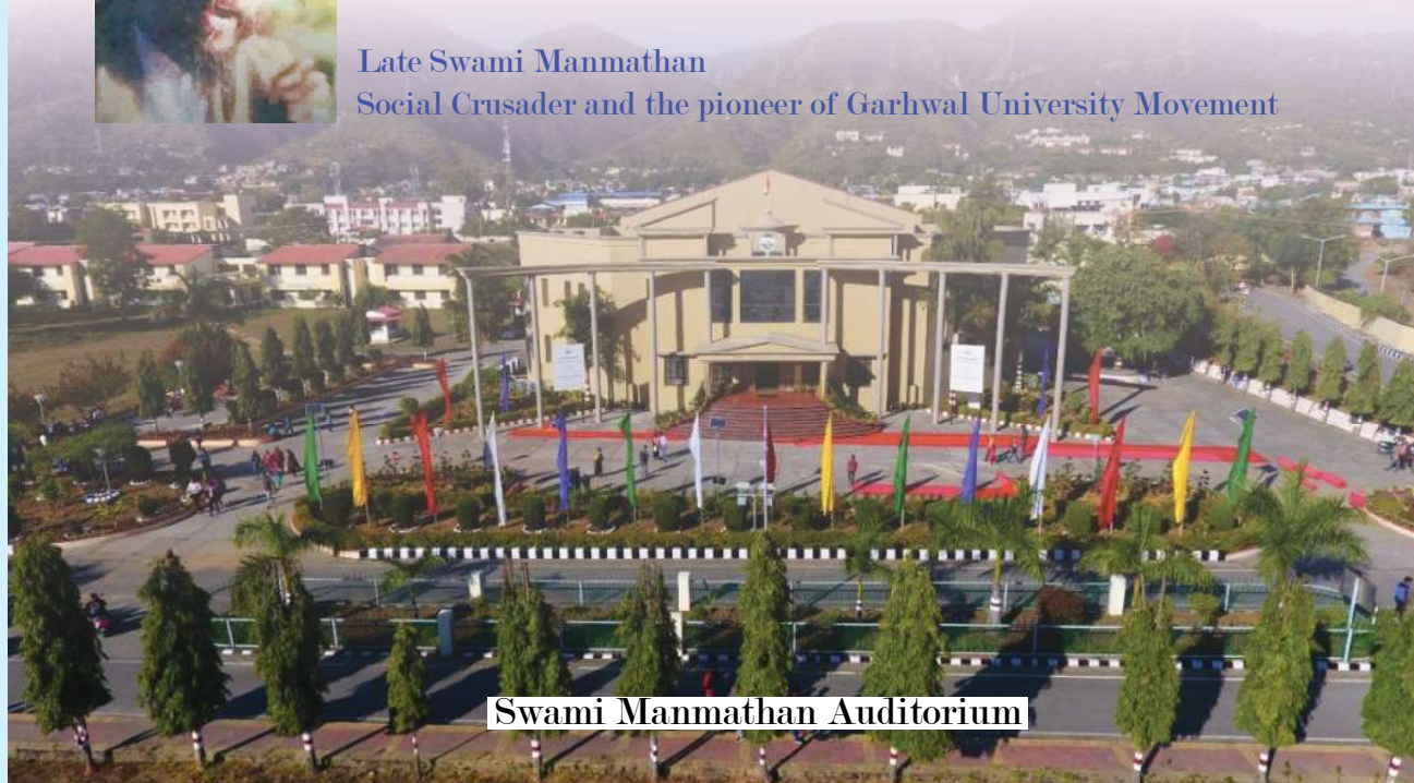
Swami Manmathan Auditorium