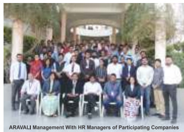
ARAVALI Management With HR Managers of Participating Companies