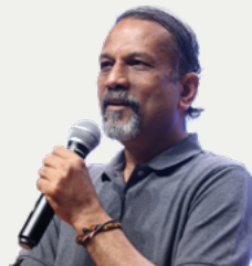
Sri Sridhar Vembu Founder and CEO, ZOHO Corporation

The vision is to create a world-class university here in Bengaluru, and the first sign of that is the campus. Everything at Chanakya University represents world-class education, with Indian values.