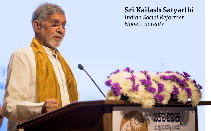
Sri Kailash Satyarthi Indian Social Reformer Nobel Laureate

A university rooted in India's knowledge heritage and striving for global excellence.