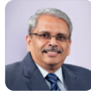
Sri Kris Gopalakrishnan Co-founder, Infosys Chairman, Axilor Ventures