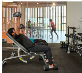
Gym and Indoor Games