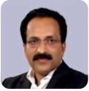
Dr. S. Somanath Chancellor, Chanakya University Former Chairman, ISRO