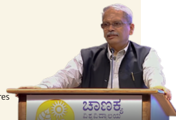
Sri Kris Gopalakrishnan Chairman Axilor Ventures Co-founder Infosys

The vision is to create a world-class university here in Bengaluru, and the first sign of that is the campus. Everything at Chanakya University represents world-class education, with Indian values.