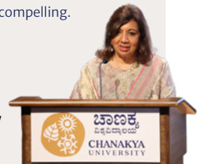
Dr. Kiran Mazumdar - Shaw Executive Chairperson Biocon Limited

Chanakya University is a new-age NEP+ University in Bangalore. Its vision is to create young Indian graduates who are global in outlook but strongly rooted in Indic civilizational values. It will create an economic environment based on curiosity, interactions with faculty, and an atmosphere that fosters learning aligned with what the world requires today.