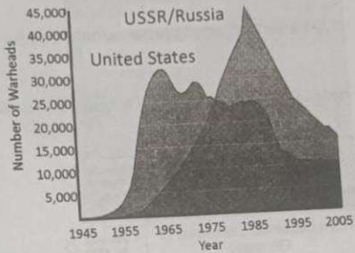
US and USSR nuclear stockpiles

33. (A) Locate the following on the outline map of India.