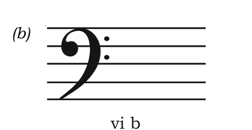
In the key of F major scale.