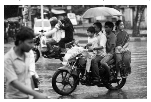
* NOTE: Picture Description OR Pie Chart (Paper Setter's choice)

66. Look at the given picture which illustrates water scarcity faced by the people and write a description in two paragraphs. You must add your own ideas /comments: (about 80 words) (3)