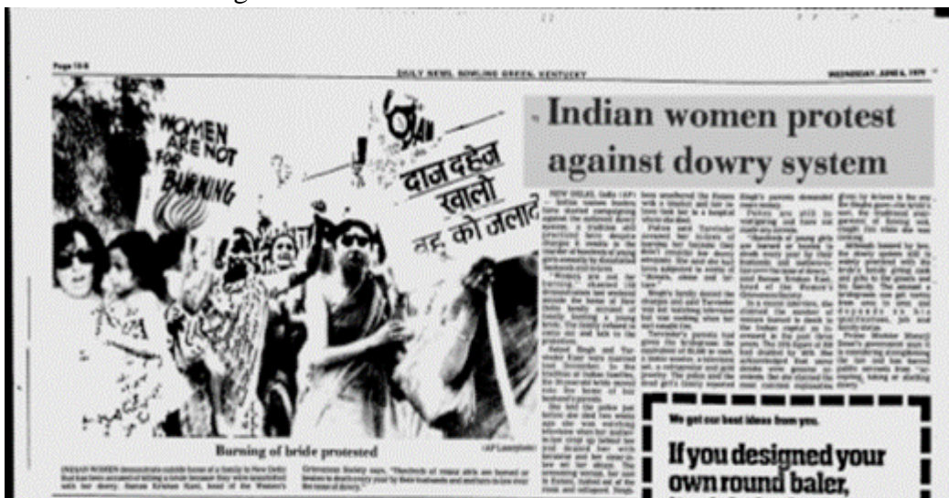
News article on the protest. 1979, New Delhi.

With reference to the image given below, explain how the fight against the dowry system took shape in various forms during 1970s and 1980s in India.