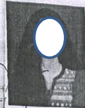
कर्नल/कमान Commanding Officer उत्तरी कमान प्रोवोस्ट इकाई Northern Comd Provost Unit

Vill - [redacted] PO - Hasinpur Teh - Jajpur Distt - Jajpur State - Odisha PIN - 75 [redacted]