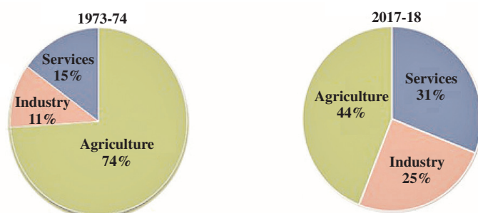
Sectoral shares of employment

12. Locate the following in the given-out line map of World.